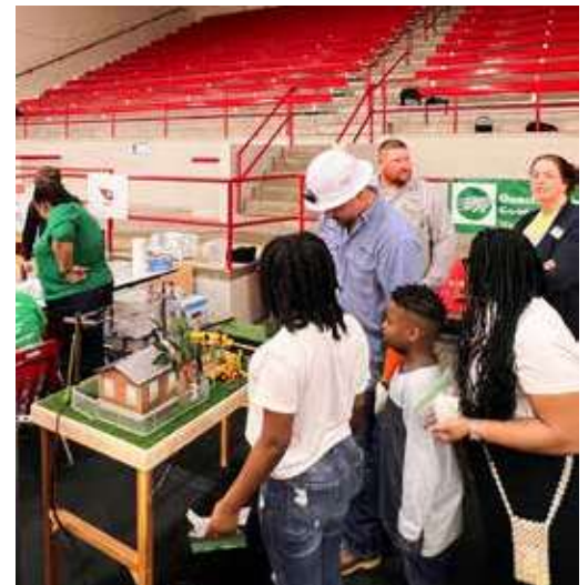
Ouachita Electric's lineworkers take part in Camden Fairview Elementary STEM Day, where energy-themed demonstrations help teach students about electricity and safety.