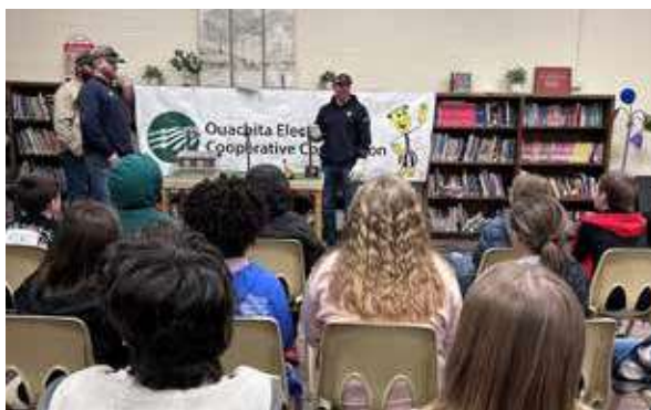
At Hampton Elementary's STEM Day, Ouachita Electric lineworkers talk about the dangers of electricity and how to stay safe around it.