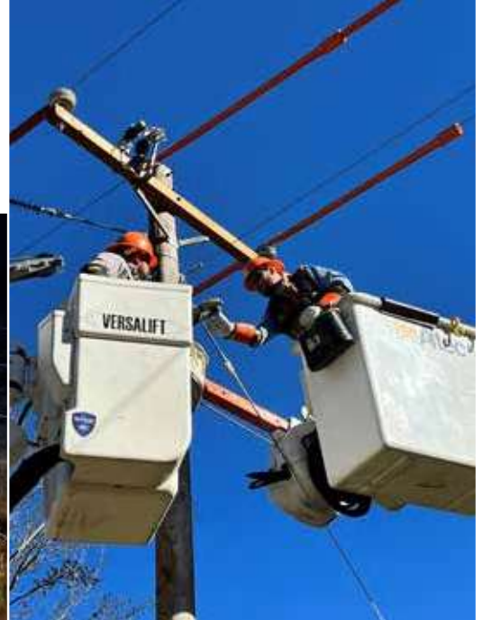
Ouachita Electric crews worked long hours restoring power after a severe thunderstorm in April caused outages for more than 1,800 members.