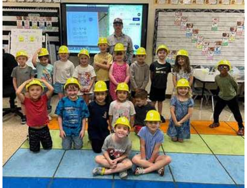
Lineworkers from Ouachita Electric participate in Hampton Elementary's Read Across America Week.

We recognize the immense dedication and hard work it takes for students to excel. By participating in the Ouachita County Spelling Bee, we wanted to highlight and celebrate academic excellence. These moments of student achievement reflect the very same values of perseverance and dedication that we strive to uphold at the cooperative every day.