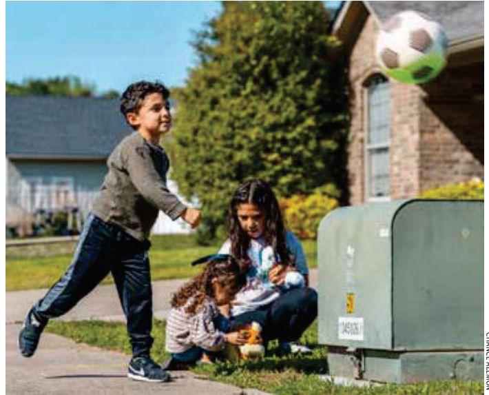
Teach children to stay away from big green metal boxes known as pad-mounted transformers that carry high-voltage electrical equipment.